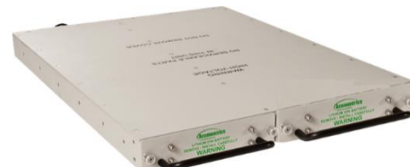
ANG1251XRBP Extended Battery Chassis